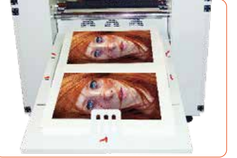
Table jogger on delivery