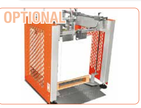
Stacker on delivery:

FALCON B1 is available with an optional pallet delivery pile system which can be unloaded using a hand pallet truck or forklift.