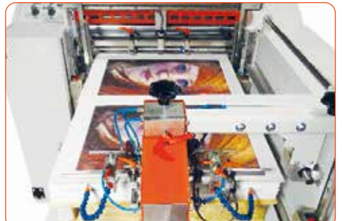
Feeding Module Delivery table with air fans