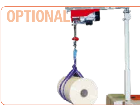
Crane to ease film loading

FALCON B1 is available with an optional pallet delivery pile system which can be unloaded using a hand pallet truck or forklift.